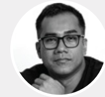
Kaustav Saikia Art & Fashion Photographer Kolkata