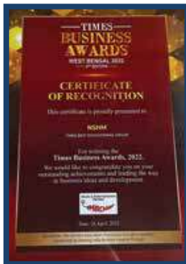
NSHM Knowledge Campus got certified at the Times Business Awards in the year 2022.