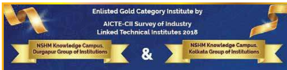
With a legacy of more than 25+ years in UG and PG education in West Bengal, NSHM has been enlisted as a Gold Category Institute by a survey jointly conducted by AICTE and CII.