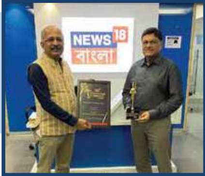
NSHM Knowledge Campus has been honoured with the award for "Excellence in Education Legacy" organised by News 18.