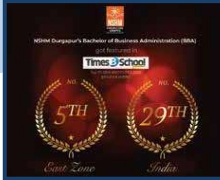
The institute of BBA located in the sprawling campus of Durgapur has got featured in the Times B-School magazine as one of the best in Eastern India and Nationally in the year 2022.