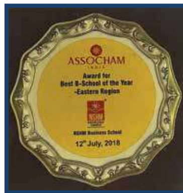
NSHM Business School has been awarded the best B-School of the year 2018 Eastern Region by ASSOCHAM India