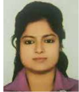
Khushnuma Naushin Rainbow Hospitals