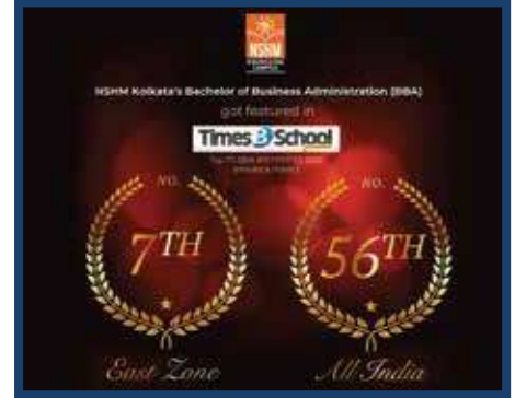
NSHM's BBA programme got featured in Times B-School Magazine and has ranked 7th & 56th in Eastern India and Nationally in the year 2022.